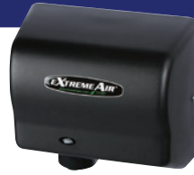
Steel Black Graphite