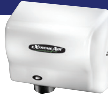
Steel White Epoxy