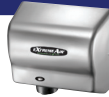
Steel Satin Chrome